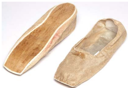
FIG. 7. A pair of lace-bark slippers, c. 1827. The lace-bark is overlaid on silk and the soles of the slippers are made of coconut bark. They appear never to have been worn. Length: 28 cm.

Photograph: © Royal Botanic Gardens, Kew (EBC 67770).