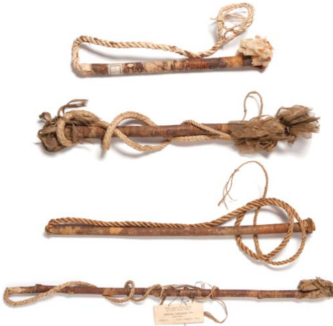
FIG. 3. Lace-bark whips made from branches of the lace-bark tree. The inner woody portion and outer bark have been partially removed and the remaining inner bark twisted into the whip tails. Length of handle, reading from top to bottom: EBC 75996 36 cm; EBC 44946(1) 43 cm; EBC 44946(2) 49 cm; EBC 44956 60 cm.